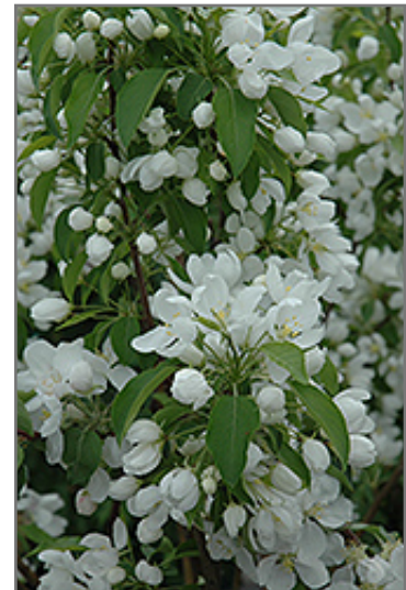
Spring Snow Crabapple flowers