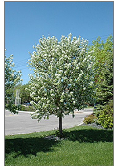
Spring Snow Crabapple in bloom