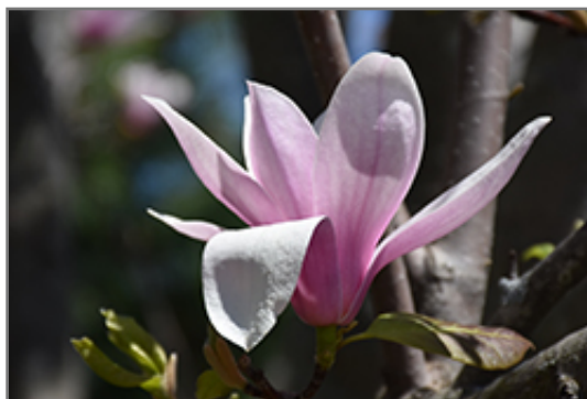
Alexandrina Saucer Magnolia flowers