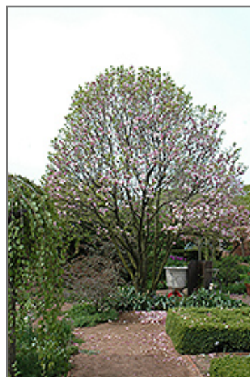
Alexandrina Saucer Magnolia in bloom