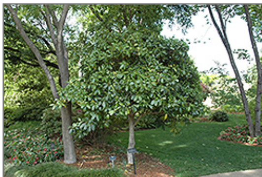
Lusterleaf Holly