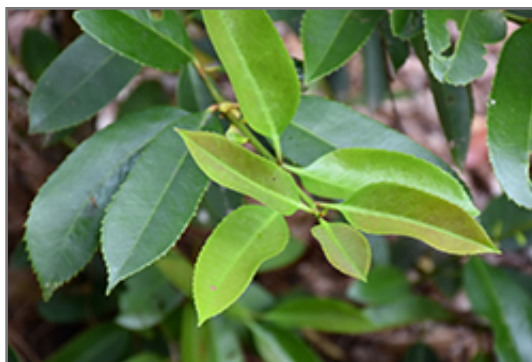
Lusterleaf Holly foliage