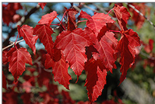
Amur Maple in fall