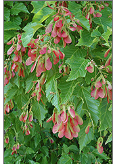
Amur Maple fruit

This tree does best in full sun to partial shade. It is very adaptable to both dry and moist locations, and should do just fine under average home landscape conditions. It is not particular as to soil type or pH. It is highly tolerant of urban pollution and will even thrive in inner city environments. This species is not originally from North America.