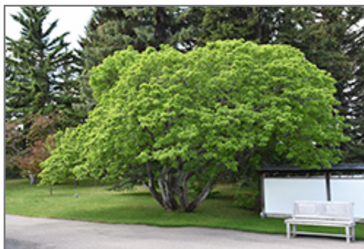
Amur Maple