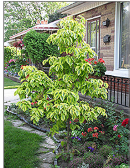
Cherokee Daybreak Flowering Dogwood

Cherokee Daybreak Flowering Dogwood is recommended for the following landscape applications;