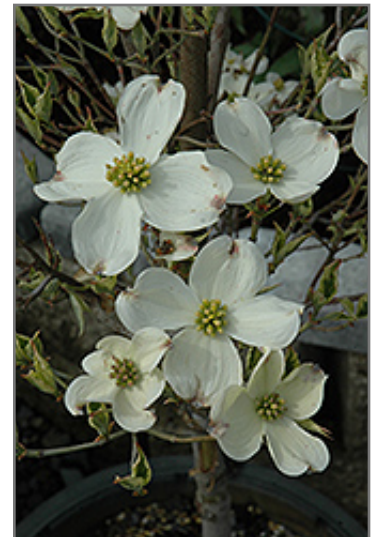
Cherokee Daybreak Flowering Dogwood flowers