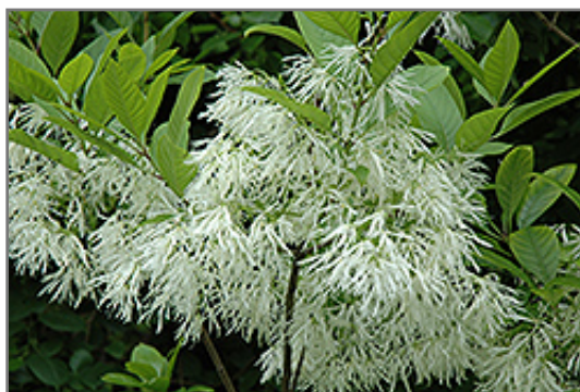
White Fringetree flowers