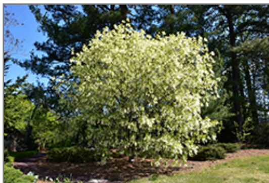
White Fringetree in bloom