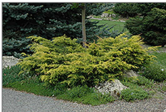
Old Gold Juniper

Old Gold Juniper will grow to be about 3 feet tall at maturity, with a spread of 4 feet. It tends to fill out right to the ground and therefore doesn't necessarily require facer plants in front. It grows at a slow rate, and under ideal conditions can be expected to live for approximately 30 years.