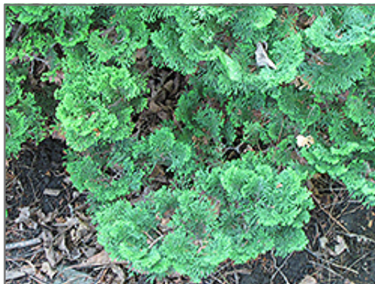
Nana Dwarf Hinoki Falsecypress foliage