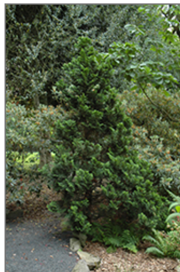
Nana Dwarf Hinoki Falsecypress

Nana Dwarf Hinoki Falsecypress is recommended for the following landscape applications;