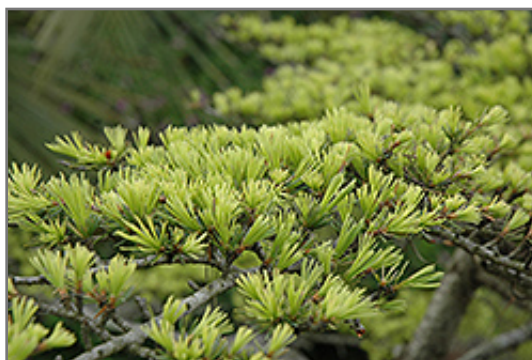
Golden Deodar Cedar foliage