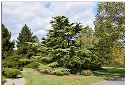
Golden Deodar Cedar