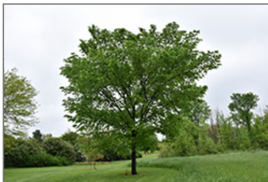
Valley Forge Elm