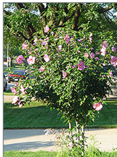
Aphrodite Rose of Sharon in bloom