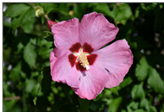
Aphrodite Rose of Sharon flowers

This is a high maintenance shrub that will require regular care and upkeep, and is best pruned in late winter once the threat of extreme cold has passed. It is a good choice for attracting butterflies and hummingbirds to your yard, but is not particularly attractive to deer who tend to leave it alone in favor of tastier treats. Gardeners should be aware of the following characteristic(s) that may warrant special consideration;