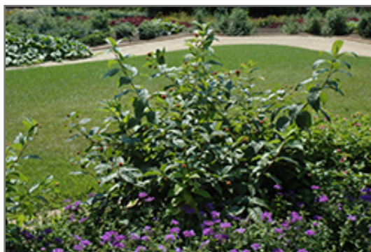
Button Bush