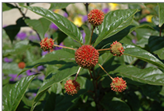
Button Bush flowers