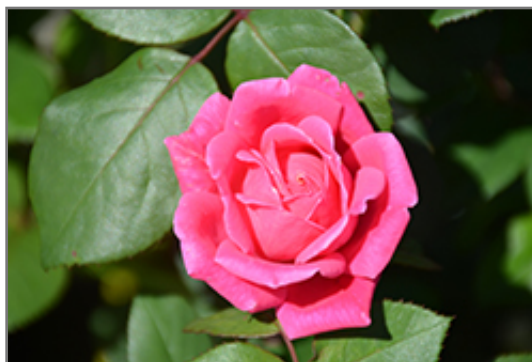
Pink Double Knock Out Rose flowers