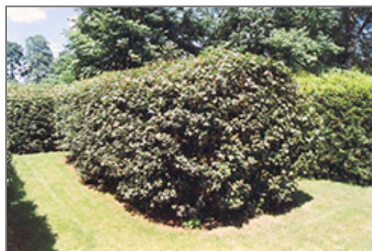
Hedge Maple