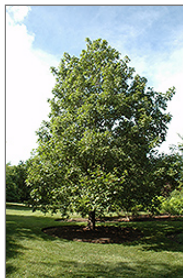
Hedge Maple