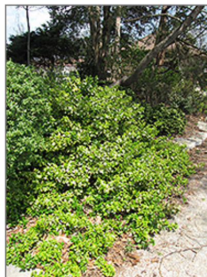
Emerald 'n' Gold Wintercreeper