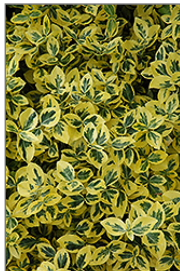
Emerald 'n' Gold Wintercreeper foliage