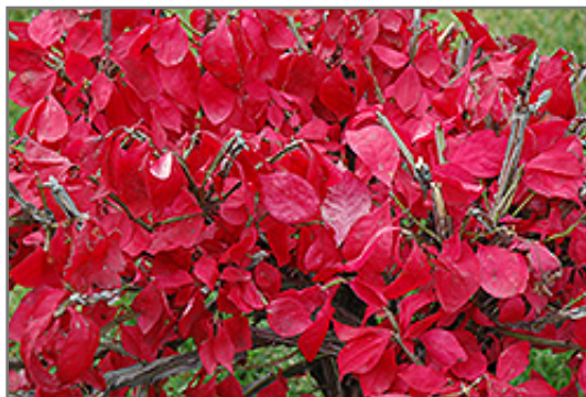
Dwarf Burning Bush in fall