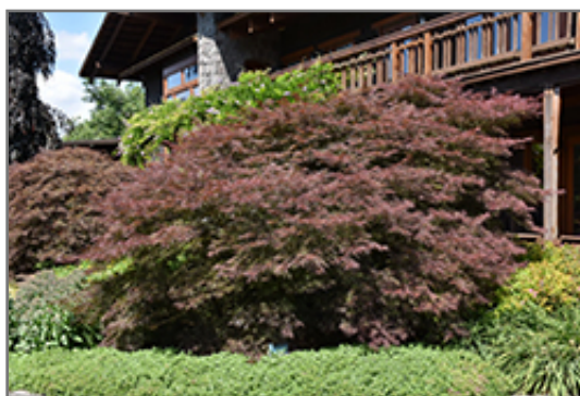
Ever Red Lace-Leaf Japanese Maple