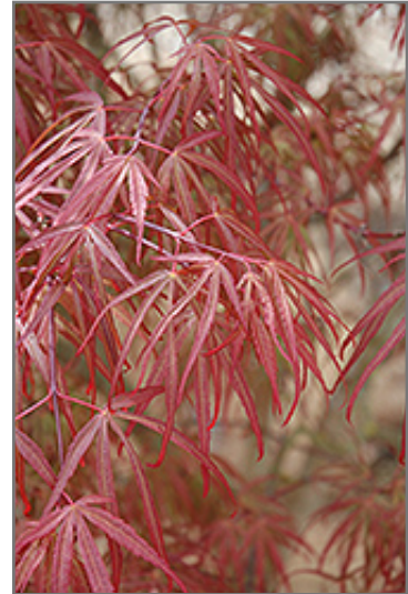
Ribbon-leaf Japanese Maple foliage

Ribbon-leaf Japanese Maple is recommended for the following landscape applications;