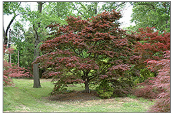
Ribbon-leaf Japanese Maple