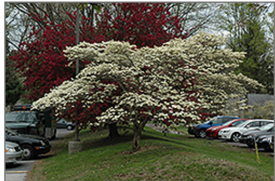
Cloud 9 Flowering Dogwood in bloom