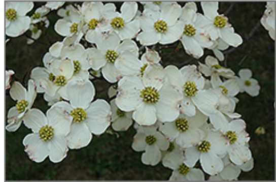
Cloud 9 Flowering Dogwood flowers

Cloud 9 Flowering Dogwood is recommended for the following landscape applications;