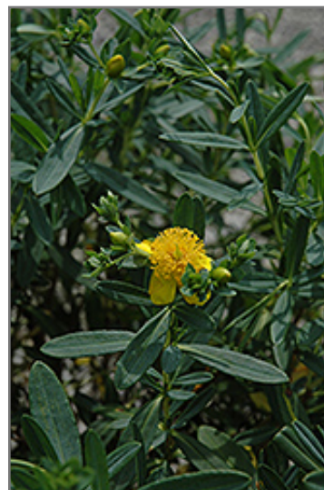
Blue Velvet St. John's Wort flowers

Blue Velvet St. John's Wort will grow to be about 24 inches tall at maturity, with a spread of 18 inches. It tends to fill out right to the ground and therefore doesn't necessarily require facer plants in front. It grows at a medium rate, and under ideal conditions can be expected to live for approximately 5 years.