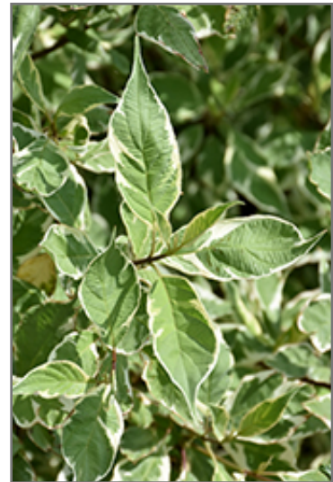
Silver Variegated Dogwood foliage