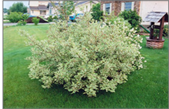
Silver Variegated Dogwood