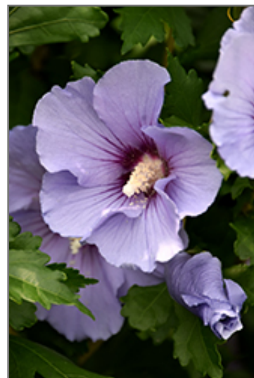
Blue Satin Rose of Sharon flowers

Blue Satin Rose of Sharon is recommended for the following landscape applications;