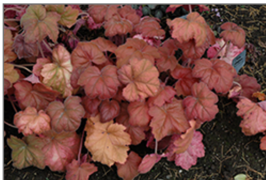
Southern Comfort Coral Bells foliage