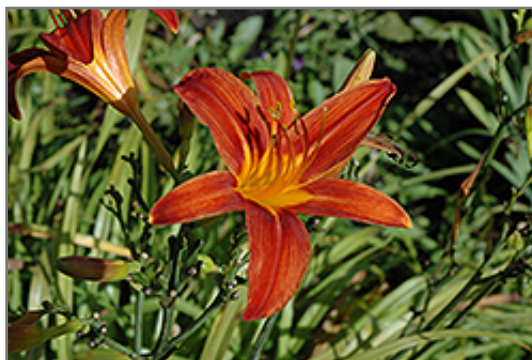
Sammy Russell Daylily flowers