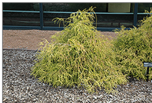
Sungold Falsecypress