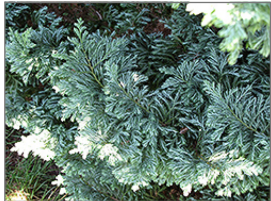
Boulevard Falsecypress foliage