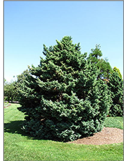
Boulevard Falsecypress

Boulevard Falsecypress is recommended for the following landscape applications;