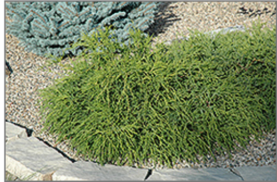
Mops Falsecypress