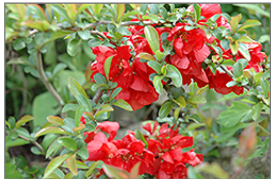
Texas Scarlet Flowering Quince flowers