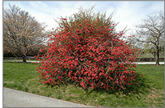
Texas Scarlet Flowering Quince in bloom

This is a high maintenance shrub that will require regular care and upkeep, and should only be pruned after flowering to avoid removing any of the current season's flowers. Gardeners should be aware of the following characteristic(s) that may warrant special consideration;