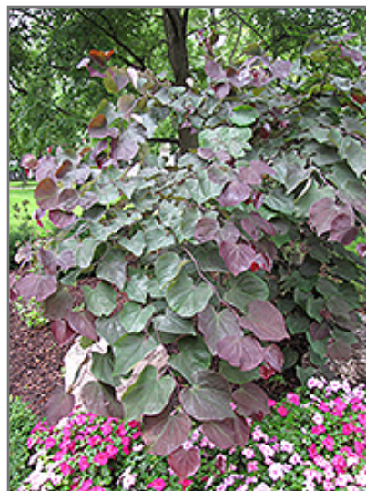
Forest Pansy Redbud foliage

This tree does best in full sun to partial shade. It prefers to grow in average to moist conditions, and shouldn't be allowed to dry out. It is not particular as to soil type or pH. It is highly tolerant of urban pollution and will even thrive in inner city environments, and will benefit from being planted in a relatively sheltered location. Consider applying a thick mulch around the root zone in winter to protect it in exposed locations or colder microclimates. This is a selection of a native North American species.