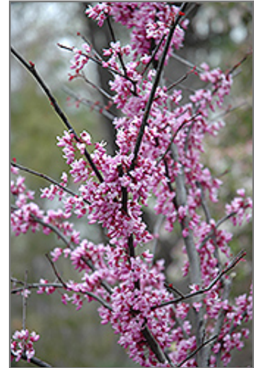
Forest Pansy Redbud flowers