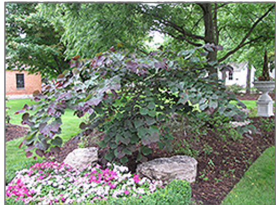
Forest Pansy Redbud