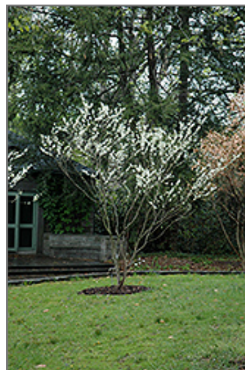
White Redbud in bloom

White Redbud is recommended for the following landscape applications;