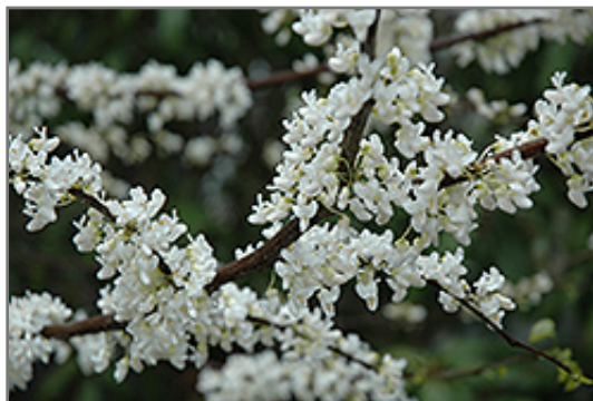
White Redbud flowers