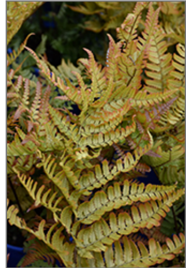
Brilliance Autumn Fern foliage