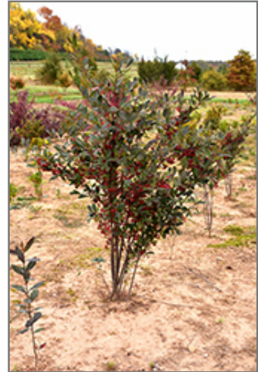
Brilliantissima Red Chokeberry fruit

This shrub should only be grown in full sunlight. It is an amazingly adaptable plant, tolerating both dry conditions and even some standing water. It is not particular as to soil type or pH, and is able to handle environmental salt. It is somewhat tolerant of urban pollution. This is a selection of a native North American species.