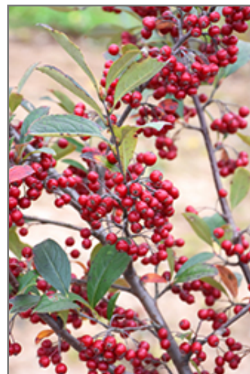
Brilliantissima Red Chokeberry fruit