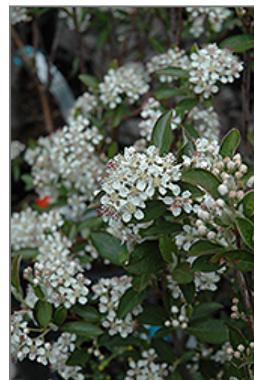
Brilliantissima Red Chokeberry flowers