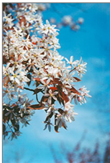
Robin Hill Serviceberry flowers