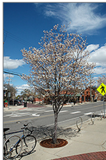
Robin Hill Serviceberry in bloom

Robin Hill Serviceberry is recommended for the following landscape applications;