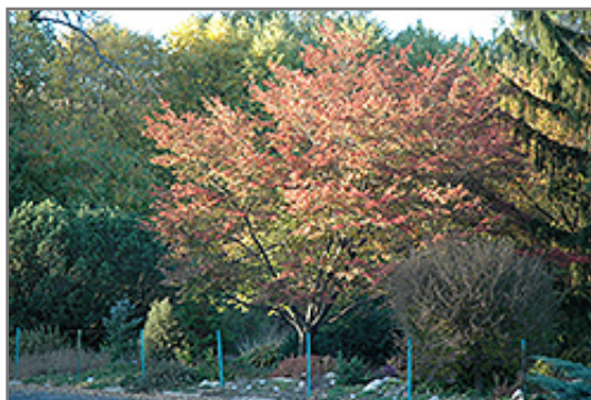
Robin Hill Serviceberry in fall

This tree does best in full sun to partial shade. It prefers to grow in average to moist conditions, and shouldn't be allowed to dry out. It is not particular as to soil type or pH. It is somewhat tolerant of urban pollution. This particular variety is an interspecific hybrid.