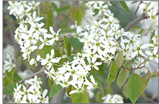
Autumn Sunset Serviceberry flowers

Autumn Sunset Serviceberry will grow to be about 25 feet tall at maturity, with a spread of 20 feet. It has a low canopy with a typical clearance of 4 feet from the ground, and is suitable for planting under power lines. It grows at a medium rate, and under ideal conditions can be expected to live for 40 years or more.