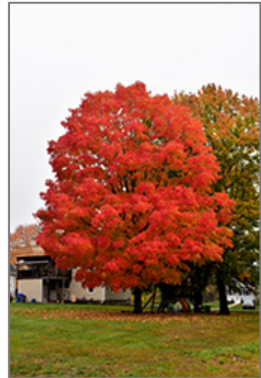
Green Mountain Sugar Maple in fall