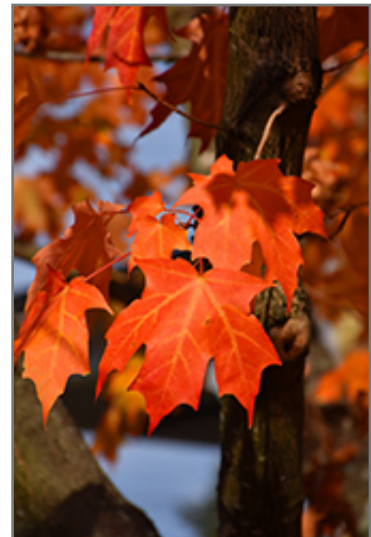
Green Mountain Sugar Maple in fall