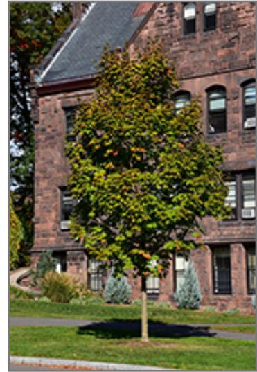
Green Mountain Sugar Maple

This tree should only be grown in full sunlight. It prefers to grow in average to moist conditions, and shouldn't be allowed to dry out. It is not particular as to soil pH, but grows best in rich soils. It is somewhat tolerant of urban pollution. This is a selection of a native North American species.