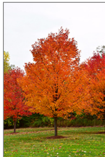
Commemoration Sugar Maple in fall