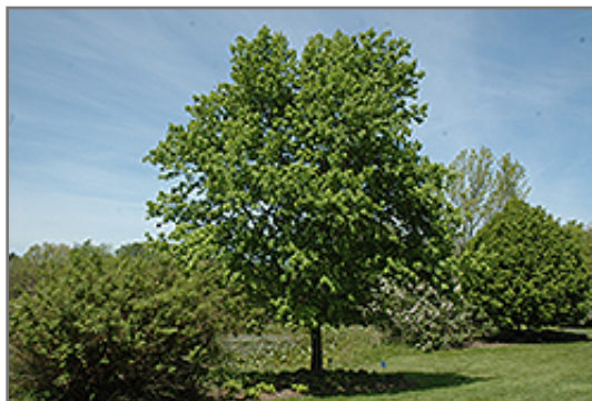
Commemoration Sugar Maple