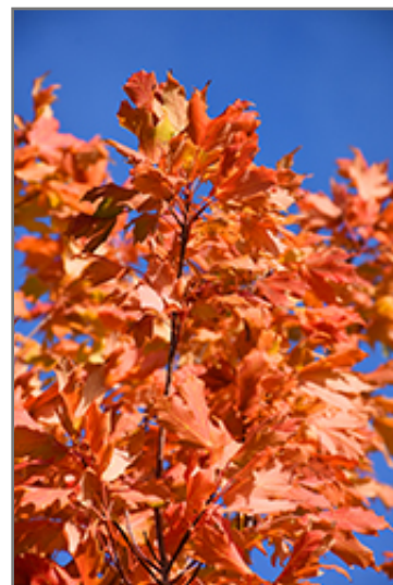
Commemoration Sugar Maple in fall

This tree should only be grown in full sunlight. It prefers to grow in average to moist conditions, and shouldn't be allowed to dry out. It is not particular as to soil pH, but grows best in rich soils. It is somewhat tolerant of urban pollution. This is a selection of a native North American species.