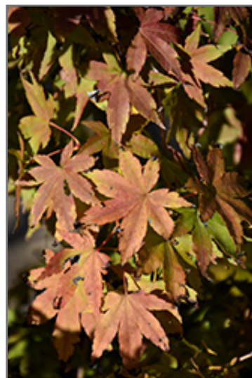
Higasa Yama Japanese Maple foliage

Higasa Yama Japanese Maple is a fine choice for the yard, but it is also a good selection for planting in outdoor pots and containers. Its large size and upright habit of growth lend it for use as a solitary accent, or in a composition surrounded by smaller plants around the base and those that spill over the edges. It is even sizeable enough that it can be grown alone in a suitable container. Note that when grown in a container, it may not perform exactly as indicated on the tag - this is to be expected. Also note that when growing plants in outdoor containers and baskets, they may require more frequent waterings than they would in the yard or garden.