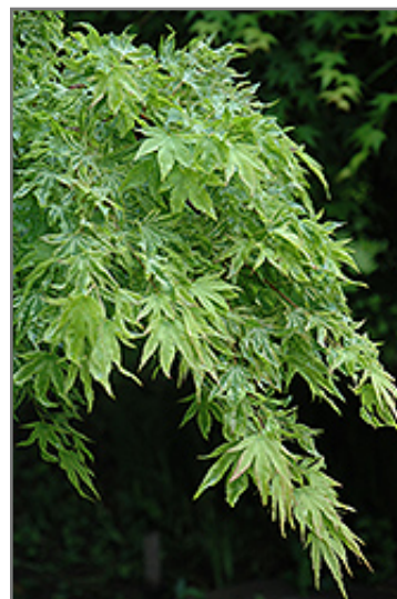
Higasa Yama Japanese Maple foliage