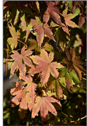
Higasa Yama Japanese Maple foliage

Higasa Yama Japanese Maple is a fine choice for the yard, but it is also a good selection for planting in outdoor pots and containers. Its large size and upright habit of growth lend it for use as a solitary accent, or in a composition surrounded by smaller plants around the base and those that spill over the edges. It is even sizeable enough that it can be grown alone in a suitable container. Note that when grown in a container, it may not perform exactly as indicated on the tag - this is to be expected. Also note that when growing plants in outdoor containers and baskets, they may require more frequent waterings than they would in the yard or garden.