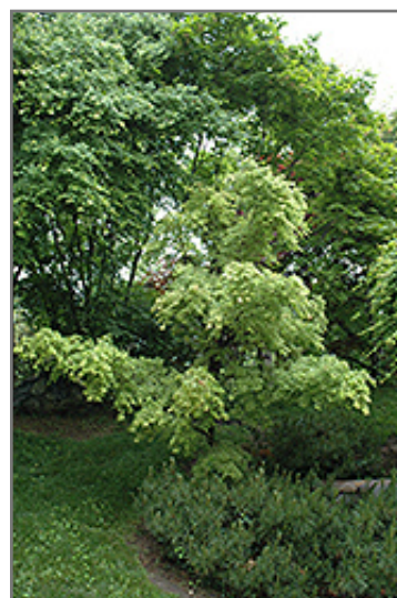
Higasa Yama Japanese Maple