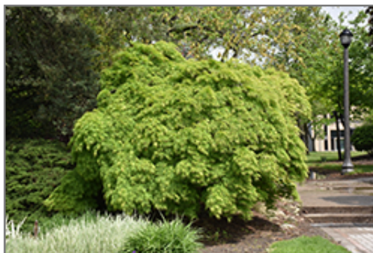
Green Cutleaf Japanese Maple