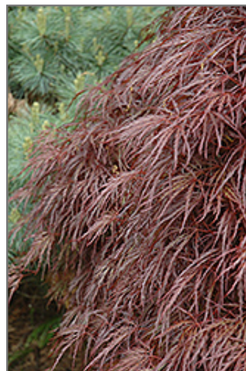
Red Select Cutleaf Japanese Maple foliage

Red Select Cutleaf Japanese Maple is recommended for the following landscape applications;