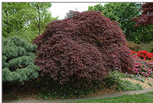
Red Select Cutleaf Japanese Maple