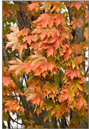
Armstrong Maple in fall