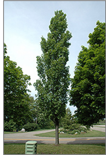
Armstrong Maple