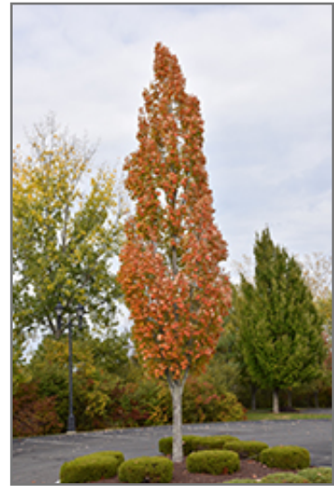
Armstrong Maple in fall

This tree should only be grown in full sunlight. It is quite adaptable, preferring to grow in average to wet conditions, and will even tolerate some standing water. It is not particular as to soil type or pH. It is highly tolerant of urban pollution and will even thrive in inner city environments. This particular variety is an interspecific hybrid.