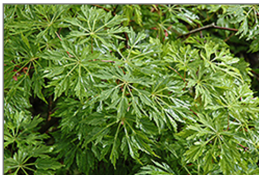
Green Cascade Maple foliage