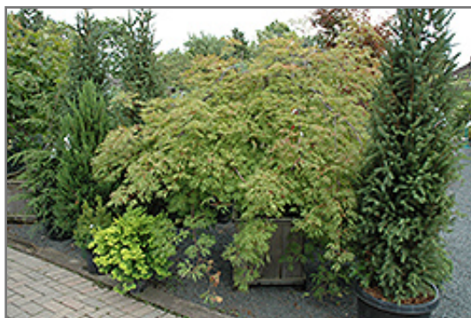
Green Cascade Maple