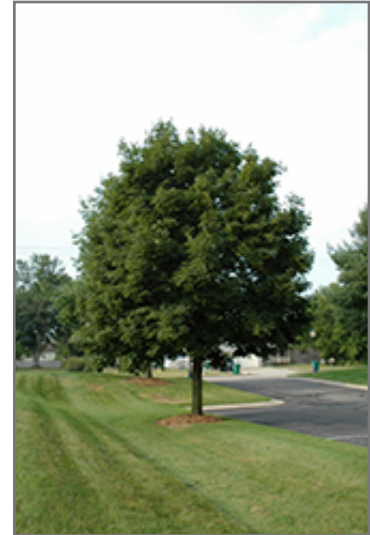
Pacific Sunset Maple

Pacific Sunset Maple will grow to be about 30 feet tall at maturity, with a spread of 25 feet. It has a low canopy with a typical clearance of 4 feet from the ground, and should not be planted underneath power lines. It grows at a slow rate, and under ideal conditions can be expected to live for 60 years or more.