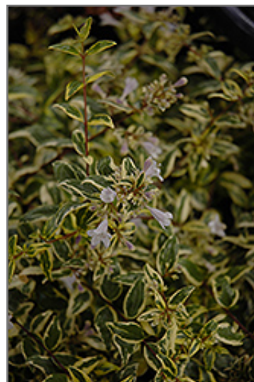
Twist of Lime Glossy Abelia flowers