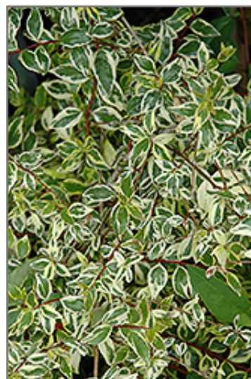
Twist of Lime Glossy Abelia foliage