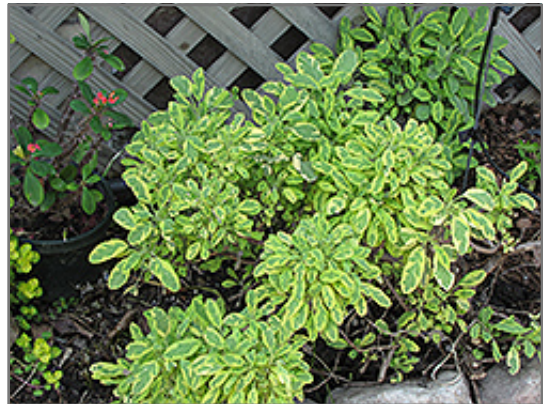
Golden Sage