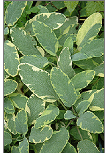
Golden Sage foliage

Golden Sage has masses of beautiful racemes of fragrant lilac purple flowers with blue overtones rising above the foliage from early to mid summer, which are most effective when planted in groupings. The flowers are excellent for cutting. Its attractive fragrant narrow leaves are grayish green in color with showy gold variegation. As an added bonus, the foliage turns a gorgeous purple in the fall.