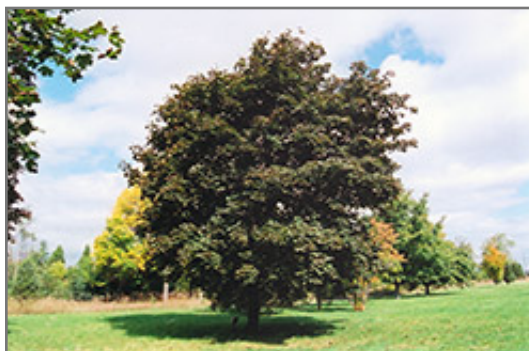
Schwedler Norway Maple

Schwedler Norway Maple will grow to be about 60 feet tall at maturity, with a spread of 60 feet. It has a high canopy with a typical clearance of 7 feet from the ground, and should not be planted underneath power lines. As it matures, the lower branches of this tree can be strategically removed to create a high enough canopy to support unobstructed human traffic underneath. It grows at a medium rate, and under ideal conditions can be expected to live to a ripe old age of 100 years or more; think of this as a heritage tree for future generations!