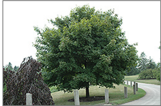
Emerald Lustre Norway Maple

Emerald Lustre Norway Maple will grow to be about 40 feet tall at maturity, with a spread of 45 feet. It has a high canopy with a typical clearance of 6 feet from the ground, and should not be planted underneath power lines. As it matures, the lower branches of this tree can be strategically removed to create a high enough canopy to support unobstructed human traffic underneath. It grows at a medium rate, and under ideal conditions can be expected to live to a ripe old age of 100 years or more; think of this as a heritage tree for future generations!