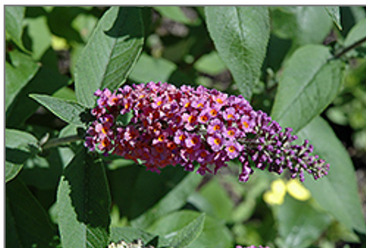
Bicolor Butterfly Bush flowers