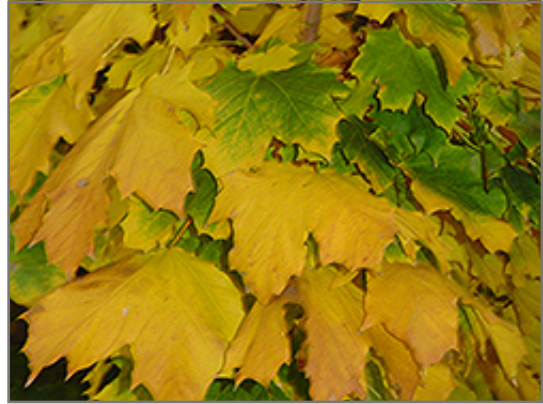
Columnar Norway Maple foliage

This tree should only be grown in full sunlight. It prefers to grow in average to moist conditions, and shouldn't be allowed to dry out. It is not particular as to soil type or pH. It is highly tolerant of urban pollution and will even thrive in inner city environments. This is a selected variety of a species not originally from North America.