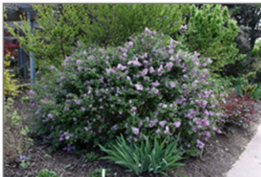
Bloomerang Lilac in bloom