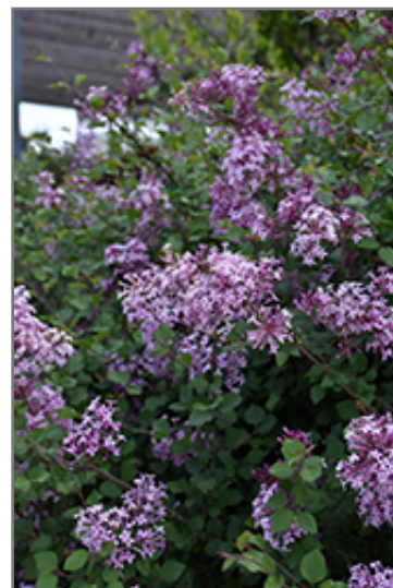
Bloomerang Lilac flowers