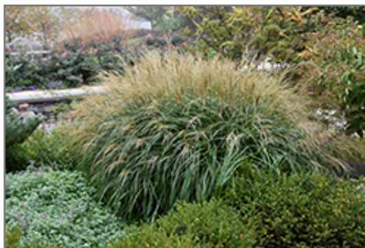
Adagio Maiden Grass fruit