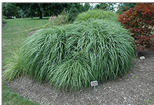
Adagio Maiden Grass foliage